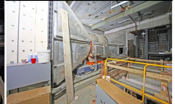
South Fan Plant in Transit Hall B4