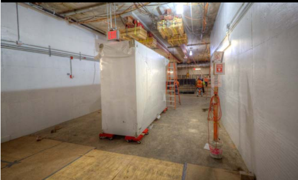
Tower 1 B4 AHUs