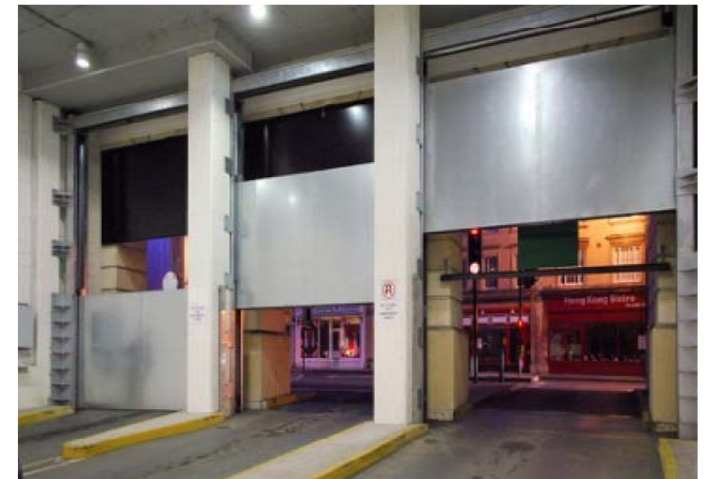
Vehicle and Personnel Door Opening Protection