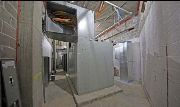
HUB Spot Network