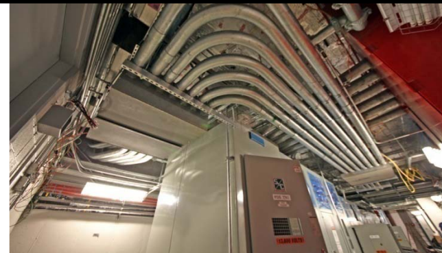
Transit Hall SNTN B4