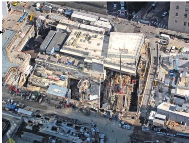
North Temporary Access Structure