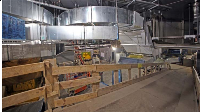
Central Fan Plant B4